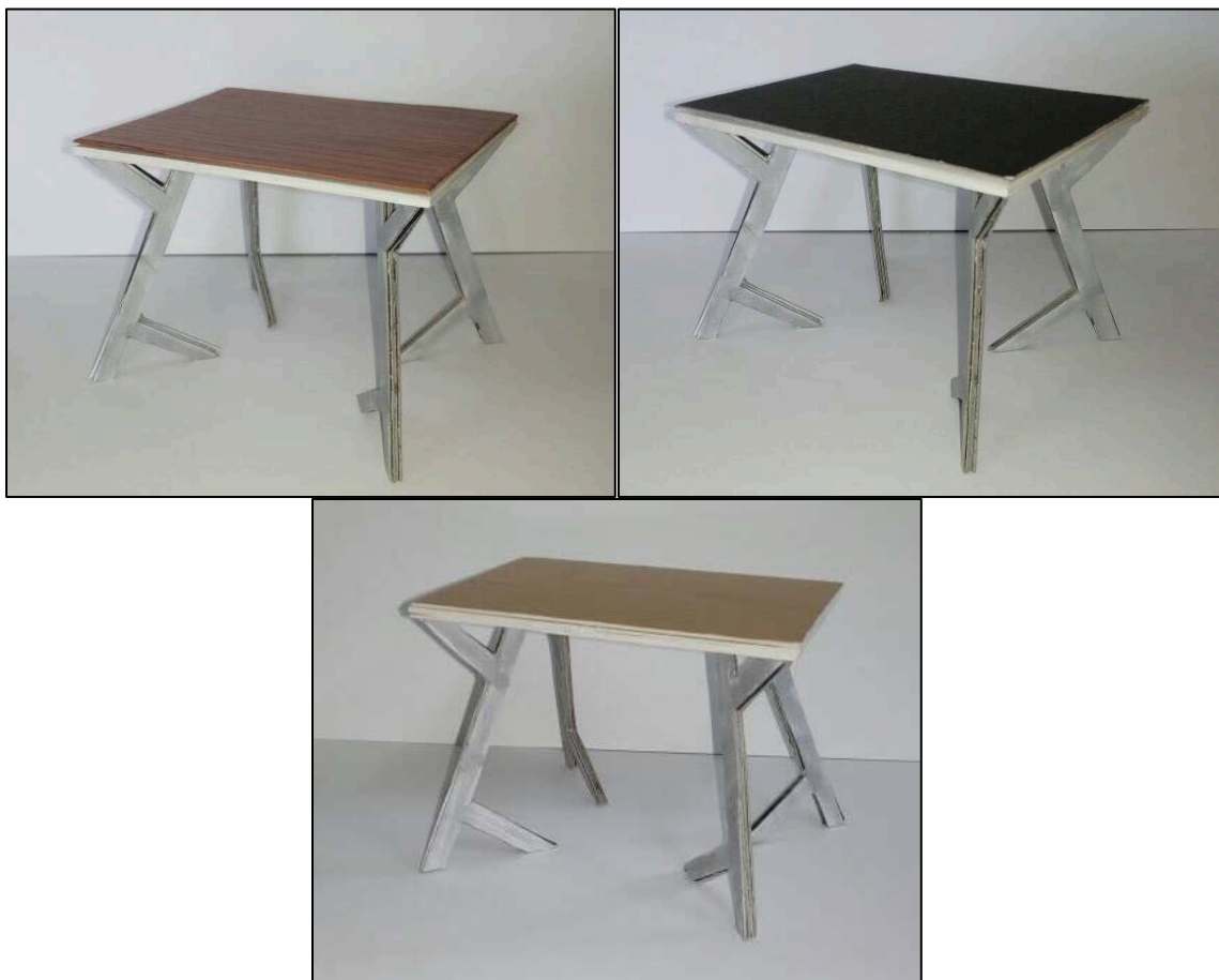
Figure 6. Mockup of chosen design in different tabletop colors.