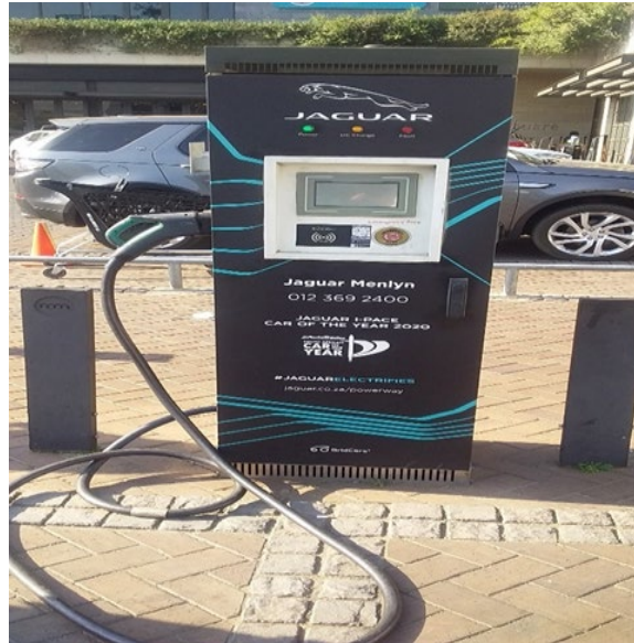
Figure 3. Charging station found at the parking lot of the Menlyn Maine shopping mall

Above charging infrastructure can be found in the parking space of the Menlyn Maine mall, located in the eastern suburb of the city of Tshwane. The spatial distribution of charging stations is not yet mapped, however, it is often argued that placing the charging infrastructure at strategic locations such as shopping malls parking lots promote awareness about the transition towards electric vehicles (see Figure 3). During the interview, one of the participants mentioned that “the issue of electric mobility is not yet prioritized by both the local and national government, therefore in the absence of regulations and associated policies, the placement of the charging infrastructure is based on mutual agreement between the private developer and the owner of the property”.