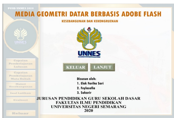
Figure 1. The Start Page Display of Adobe Flash-based Interactive Multimedia

The development of learning media tailored to the needs of students can make the learning process run optimally. The product produced in this study is Adobe Flash-based interactive multimedia of plane geometry consisting of three main parts; the opening, the core, and the closing part. The materials contained in the media are similarity and congruence. The opening section comprises the title, media development team, and institution. On the menu page, there are several buttons like Graduate Learning Outcomes/ Capaian Pembelajaran Lulusan (CPL), Subject Learning Outcomes/ Capaian Pembelajaran Mata Kuliah (CPMK), materials, practice items, and evaluation. The start page display of Adobe Flash-based interactive multimedia can be seen in Figure 1.