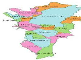
Figure 3.2 Research Locale