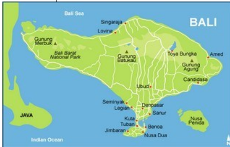
Figure 1 Location of Denpasar City

The selection of location for this study was done by purposive sampling (intentionally), that is in Subak of Sembung, Peguyangan Village, North Denpasar Sub-district, Denpasar City, Bali Province. The location of this study can be seen in Figure 1. Some considerations regarding the selection of the Subak of Sembung are: (i) the subak area is located in Denpasar City which has the high potential for land conversion; (ii) the subak has been initiated to develop an ecotourism area by the government since 2014; (iii) the subak has good agro-climate conditions for agricultural development both food crops and horticulture.