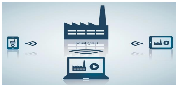
Figure.1 Fusion between real and virtual world

The industrial strategies, adopted by the different countries, strongly encourage businesses to take the momentum toward this industrial revolution while respecting the approaches and principles of sustainable development for having a harmony between its two approaches.