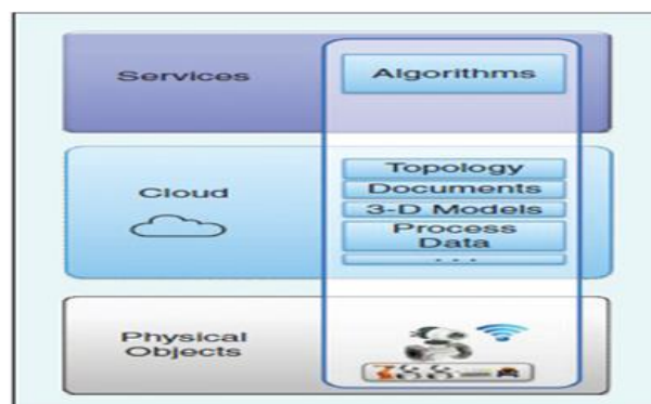
Figure. 4 The three levels which form the CPS [35]