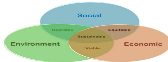
Figure. 2 The 3 pillars of sustainable development