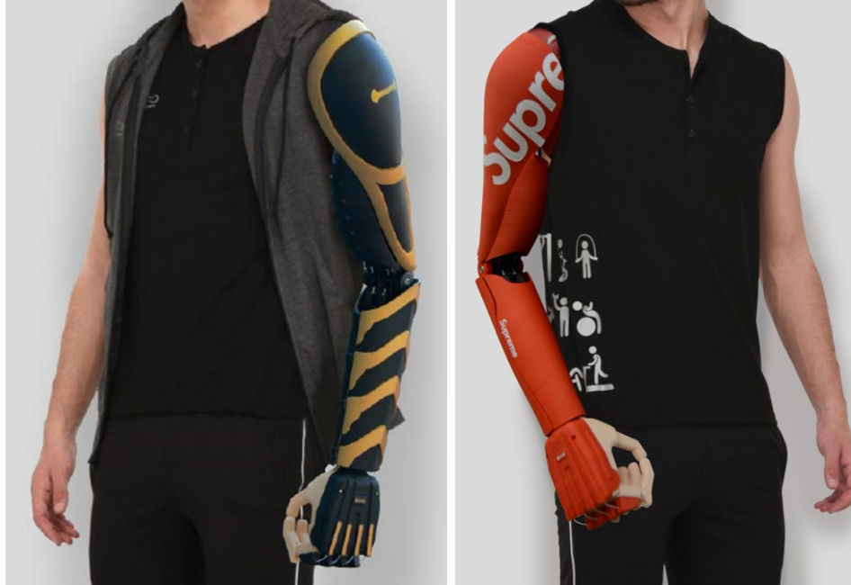
Figure 1. An example of an open-source shoulder disarticulation prosthetic design-based 3D printer that has been developed by iDIG Laboratory (Kuswanto et al., 2019)