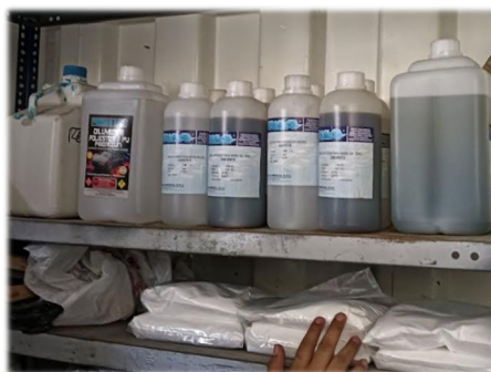
Figure 2. 5S pilot

Validation through pilot: For the 5S implementation, we made a pilot to see the effects on the employee's productivity. First, we divided the warehouse by segments (type of tools) of function. For example, all the painting and rust thinners together.