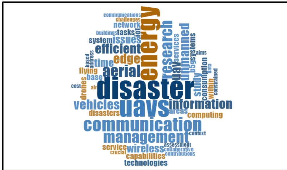
Figure 2. Word cloud

The results sections of qualitative studies are frequently organized around themes as a way of aggregating and comparing the findings from the separate studies. Figure 3 illustrates the key themes of the systematic literature review.