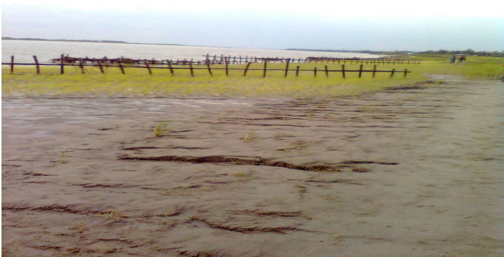
Figure 3. Crop Plantation within the recovered land