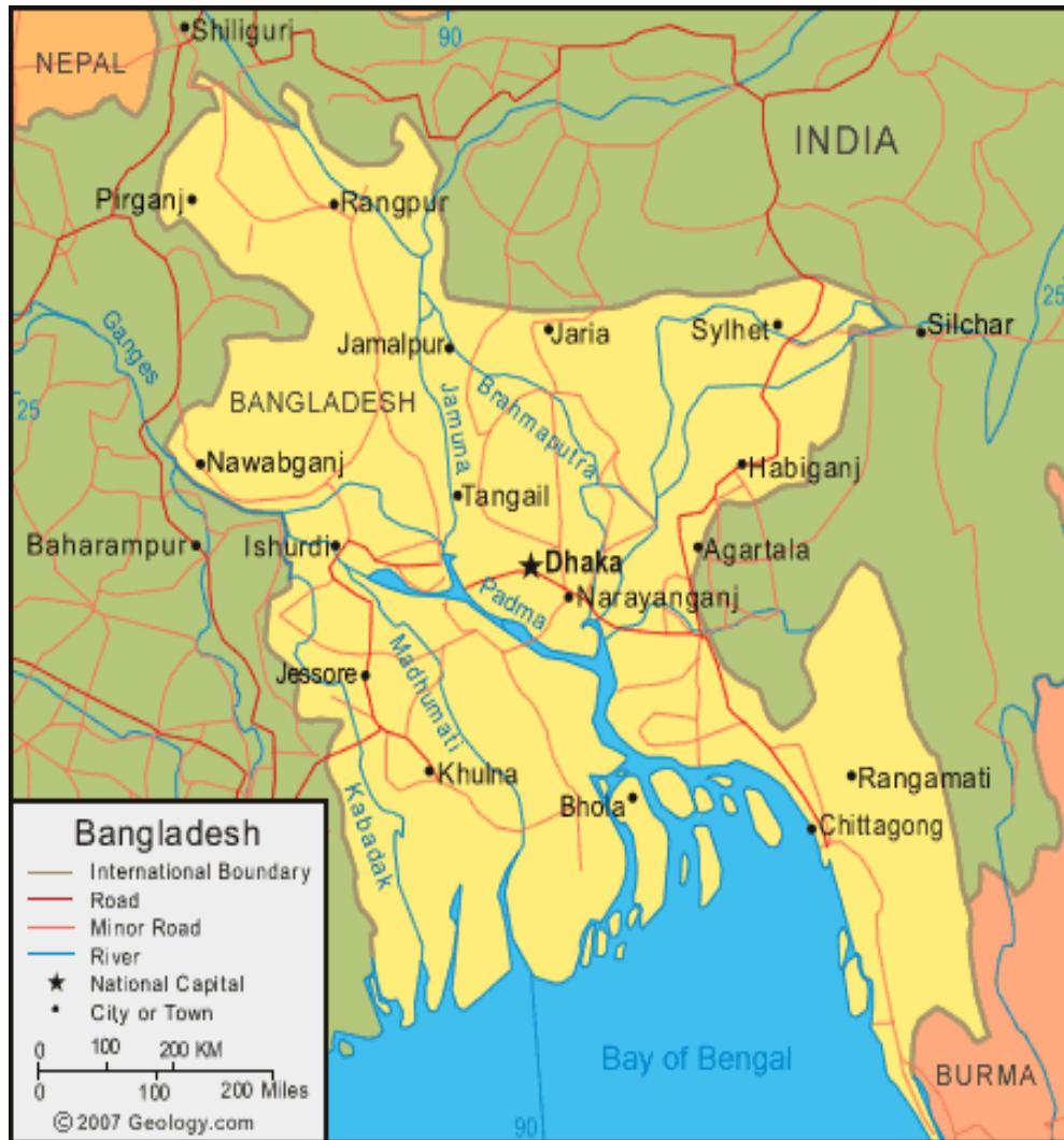
Figure 1. River System of Bangladesh

taken to address the river bank erosion protection issues (Rahman, M.L. et al, 2009). The river systems of Bangladesh are shown in Figure 2 in which so many agricultural land engulfed by the river systems.