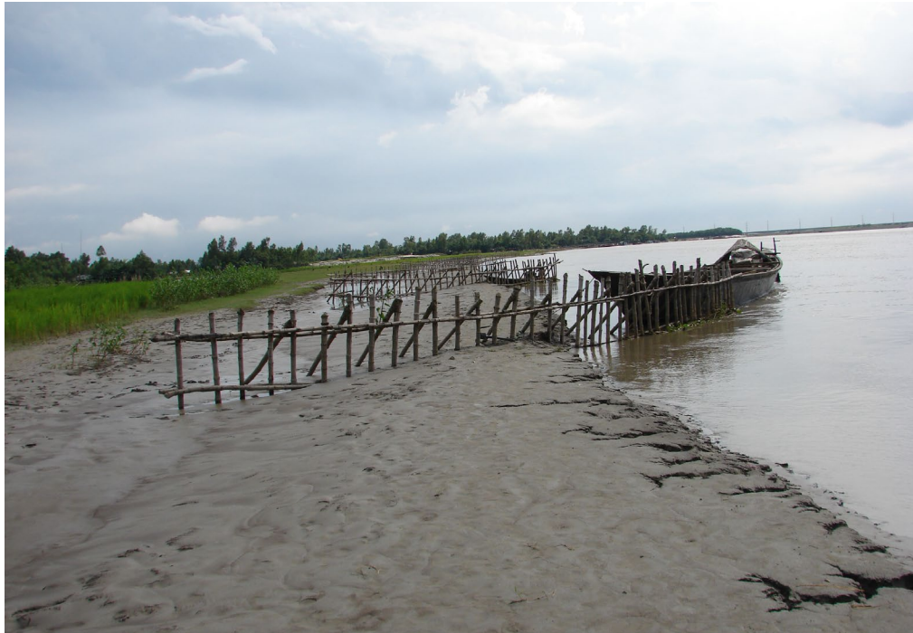
Figure 4. Recovery of land through river bank erosion protection