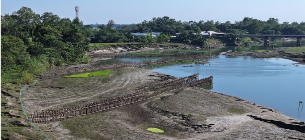
Figure 2. Small industry & market named Anada Bazar in Islampur Jamalpur are being protected using Nature-based Solution ( NBS) by Bamboo Bandalling

reduced flow passing through the opening of bandals is not sufficient to transport all the sediment coming towards this direction, resulting sedimentation over there.